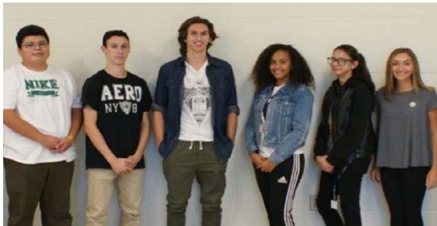
Left: Meet your new Student Council Executive Officers!

Congratulations to our Student Council Executive Officers. To the Class of 2020, know that these officers will work hard on the long but exciting journey to make the school year a memorable one.