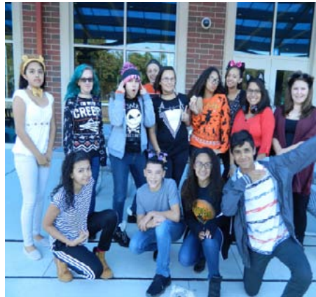
Right, Above, and Below: Students participating in Spirit Week.